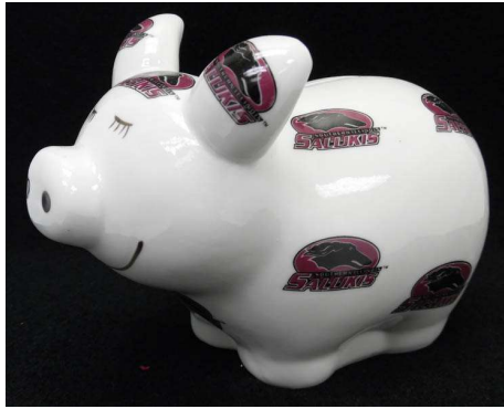
ITEM # 34725 $6.00 U-SIL BANK PIGGY LOGO ALL OVER