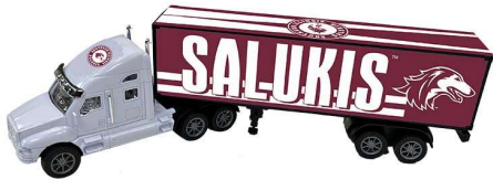
ITEM # 68863 $12.50 U-SIL TOY TRUCK BIG RIG WHT