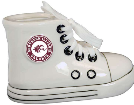
ITEM # 68877 $7.50 U-SIL BANK SHOE WHT